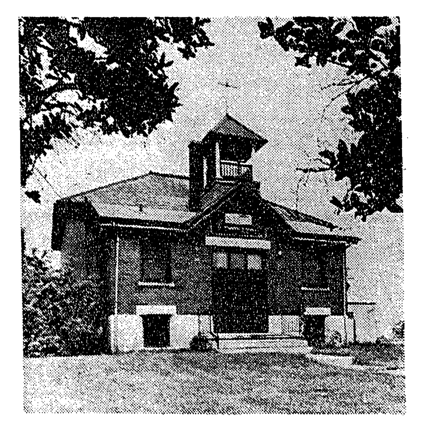
A Philathea College building in London, Ontario

In fact, said H. H. Walker, Deputy Minister of the Ontario Department of Colleges and Universities: "If Philathea were to apply today for incorporation, we would not approve of their use of the word college." In its latest catalogue, however—it is the 1969-71 cata-